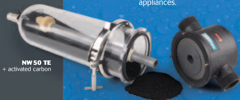
NW 50 TE + activated carbon

The activated carbon CINTROPUR SCIN is sold separately and is highly suitable for the improvement of taste and the removal of odour, chlorine, ozone, micropollutants such as pesticides and other dissolved organic substances.